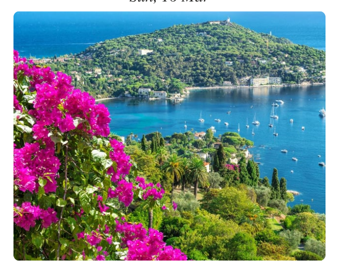
From Nice: French Riviera Full-Day Tour Sun, 16 Mar

Local enthusiastic guide Food specialities discovery Exploring of the Old City thanks to a fascinating itinerary Comments and stops on breathtaking panoramas